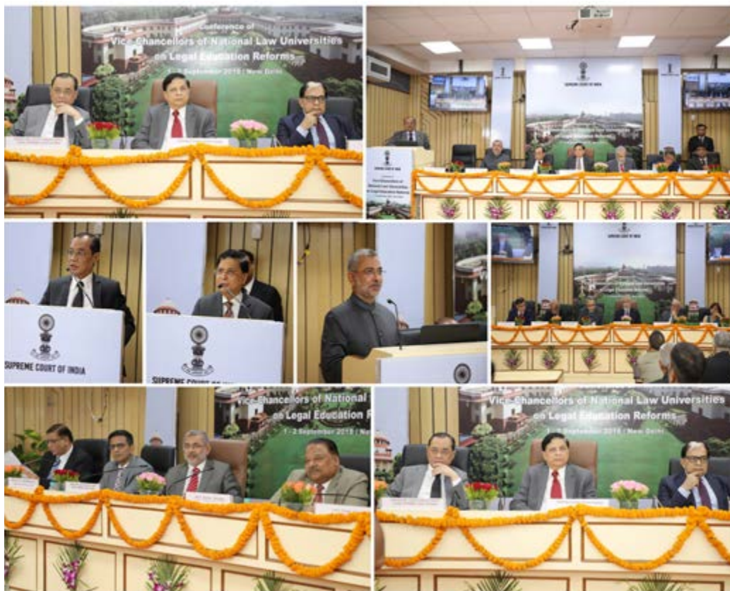
Different views from the Two-day Conference

The Supreme Court of India in collaboration with the Indian Law Institute organised a Two Day Conference of Vice-Chancellors of National Law Universities on Legal Education Reforms on September 1-2, 2018 at the Plenary Hall of the Indian Law Institute, New Delhi. Envisaged and conceptualized by the Hon'ble Chief Justice of India the conference was held to moot over the issues on 'Legal Education Reforms' and to brainstorm the solutions.