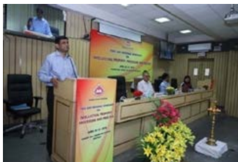
Inaugural Session of the Workshop

The Indian Law Institute organized two days National Workshop on “Intellectual Property: Procedure and Practice” on April 20-21, 2018. The objectives of the workshop was to empower students with the practical understanding of issues pertaining to procedure, processing, management and enforcement of intellectual property i.e. the filing, drafting, valuation, licensing etc. It intends to provide a platform for academicians, professionals and students to interact and discuss contemporary issues related to Intellectual Property practice.