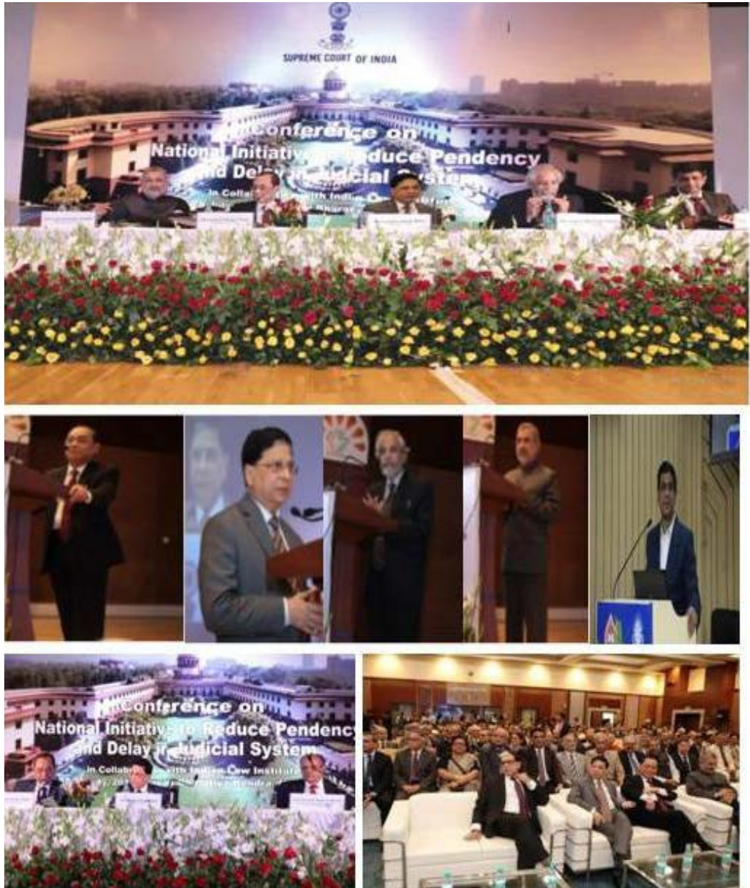
Conference at a glance

in Judicial System' on July 27-28, 2018 at Pravasi Bharatiya Kendra, New Delhi. Hon'ble Mr. Justice Dipak Misra, the then Chief Justice of India/President, ILI inaugurated the Conference in the presence of Hon'ble Supreme Court Judges, Chief Justices and Judges of various High Courts, Senior members of District courts and Senior Judges of the Supreme Court.