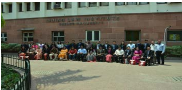
Participants of the training programme

The Indian Law Institute organised a Training Programme for Law officers from Myanmar on various subjects i.e. “Comparative Constitutional Law, Intellectual Property Rights, Cyber Law, Refugee Law, International Criminal Law’ from May 6-13, 2018. Twenty law officers from Myanmar participated in the programme.